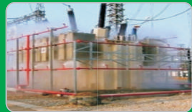
Water Spray System