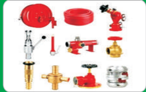
Fire Fighting Equipment