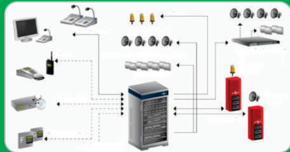
Public Address System