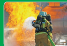
Fire Fighting Operation